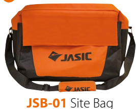
JSB-01 Site Bag