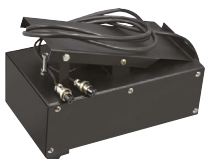
JFC-05 Foot Control Unit